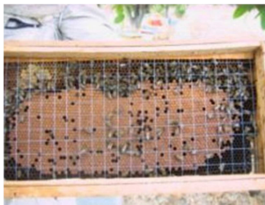
Figure 1. Grid frames placed over brood comb.

The area occupied by immature worker honeybees (eggs + larvae + capped brood) in each colony was evaluated every 21 days by overlaying a 5 \times 5 cm wire grid frame on each side of every brood frame and the area covered with the brood was visually summed [7] (Figure 1).