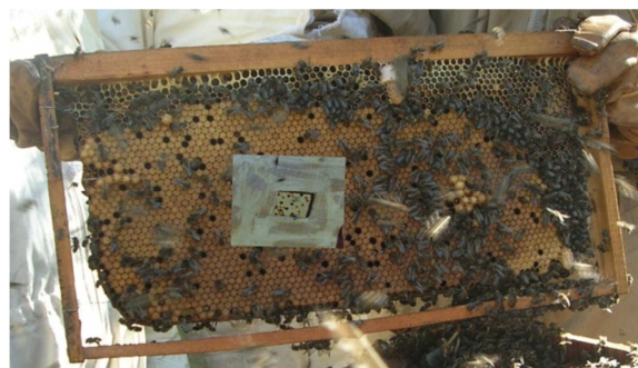
Figure 2. A piece of cardboard with a square equal in size to 10 \times 20 cells is laid over a patch of brood. Percentage brood solidness is measured directly as (200 - \text{no. empty cells}) .

Based on the first honey yield results, 40% of the colonies which were found to perform above the average honey yield were used for the evaluation of brood solidness over four brood rearing seasons (two study years). The degree of worker brood solidity was determined using a piece of cardboard cutting enclosing 10 \times 20 worker cells (area enclosing 200 cells) following a method used by Delaplane et al.[7] with little modification (Figure 2). The number of empty cells from these 200 cells was counted and recorded. Based on the total number of empty cells, percentage of viable brood was calculated for each colony under consideration. Colonies with brood solidity \geq 85\% considered as best performers and selected for the next evaluation for further selection.